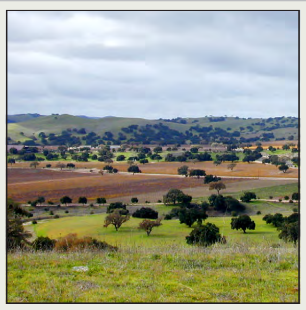
Foxen Canyon Road has not only challenging climbs and exhilarating descents, but also rewarding views like this of Firestone vinewards.