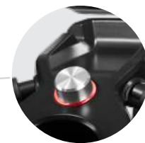
Steel Resistance Dial