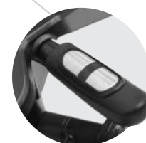
Contact Heart Rate Grips