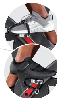
Dual SPD Pedals