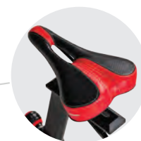
Adjustable Race-Style Seat