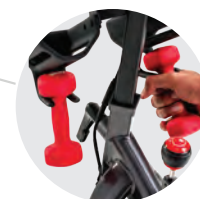
Easy Access Dumbbell Holders