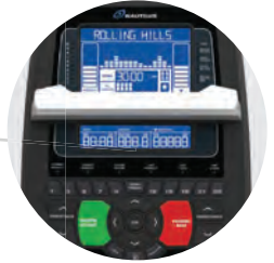
Adjustable Sight Line™ Console