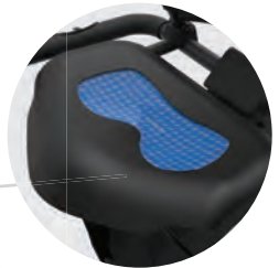
Dynamic Recline Nautilus Gel™ Seat