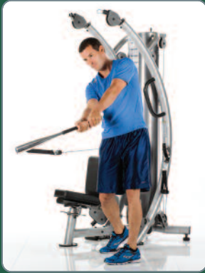
SPT-6BB Baseball Bat Handle