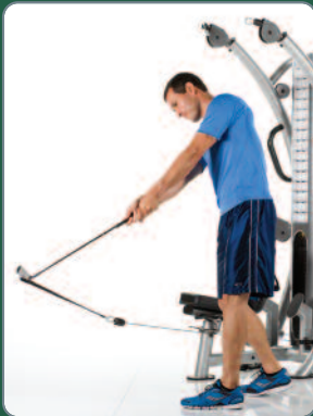
SPT-6GH Golf Handle