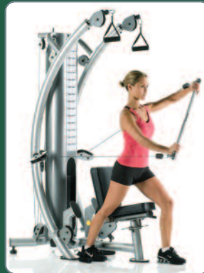
SPT-6SB Straight Bar