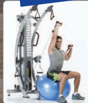
Ball Alternating Press