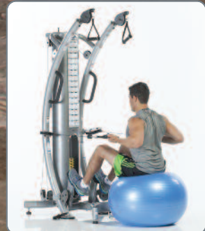
Ball Mid Row