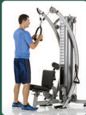
SPT-6RA Rope Accessory