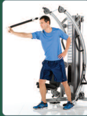
SPT-6BA Baseball Accessory