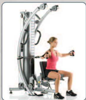
Mid Pulley Station