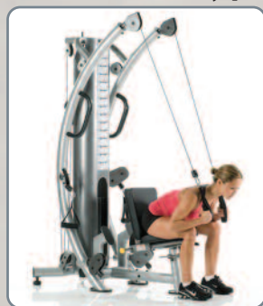
High Pulley Station

Quickly perform dozens of exercises and fitness routines without making any adjustments.