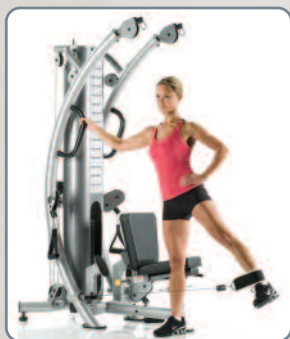
Low Pulley Station