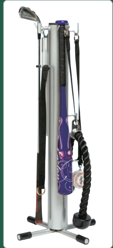
SPT-6AR Accessory Stand

Accessories as shown can be purchased separately.