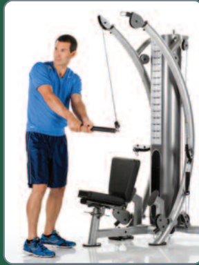
SPT-6MH Multi-Use handle